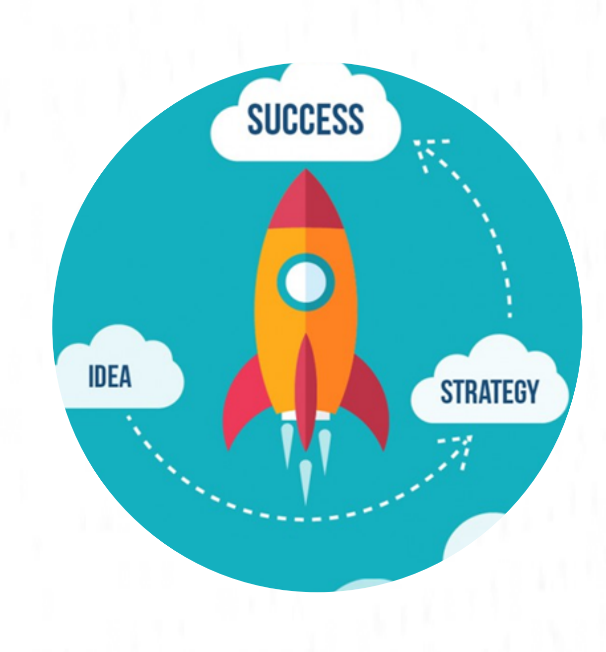
Is there an investment