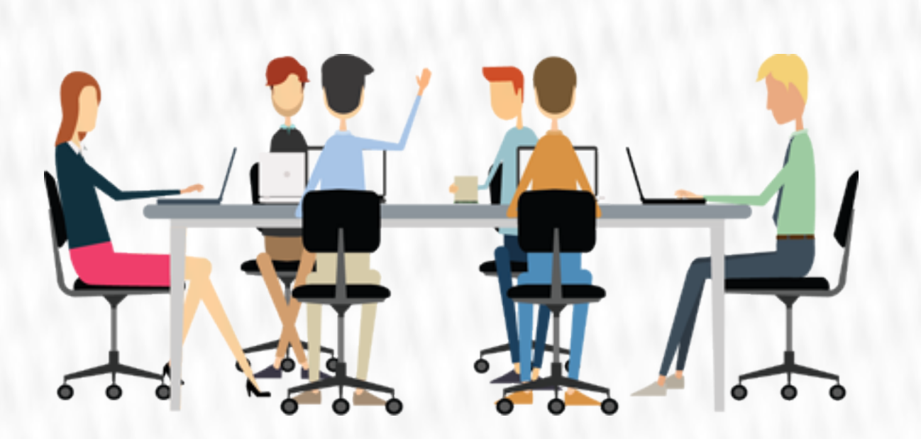
Provides tools and resources to make your job easier

Creates partnerships with the best solution providers