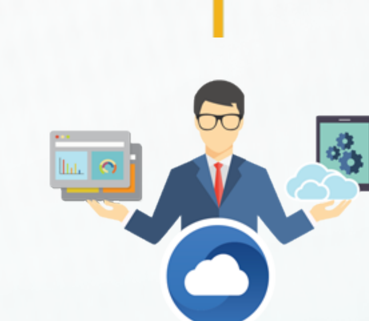
Helps measure your business benchmarks with high level consulting