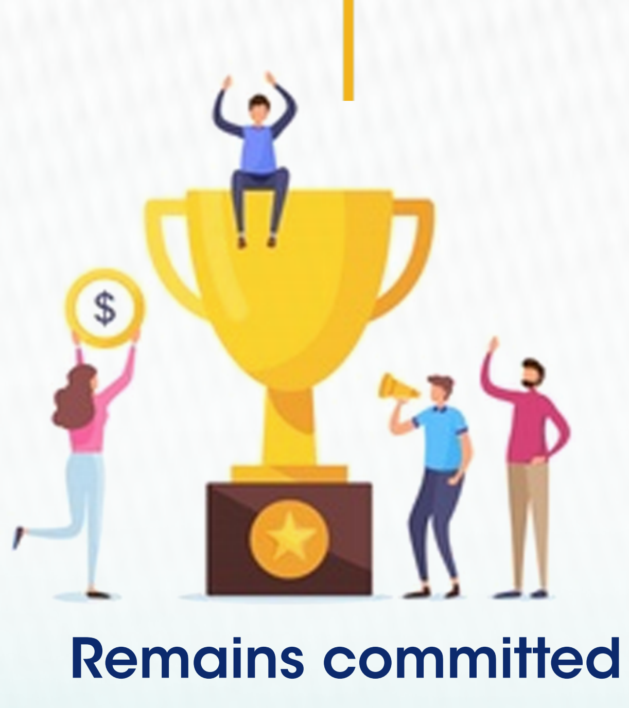
to your success