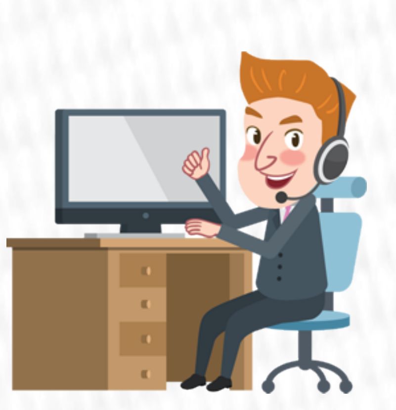
Introduces you to the latest industry innovations