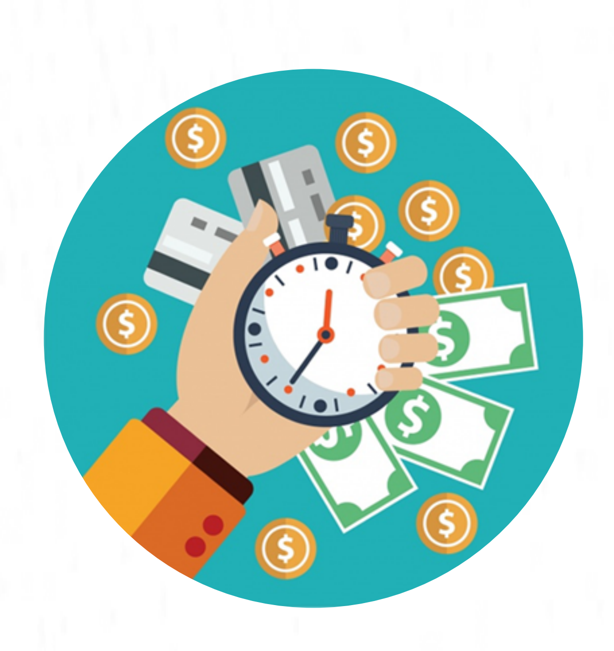
Does the underwriting support all of my transactions?