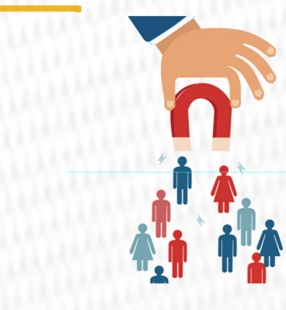
Helps market your business to new customers

Creates partnerships with the best solution providers